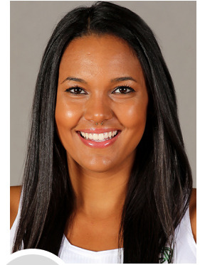
33 Lexi Petersen @lexip33